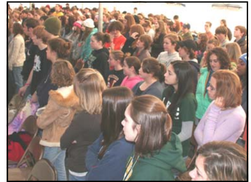
Fall Workshop youth worship in the BIG TENT. This is an intense experience.

Evening worship kicked off with the band playing jamming praise songs. People got on chairs and