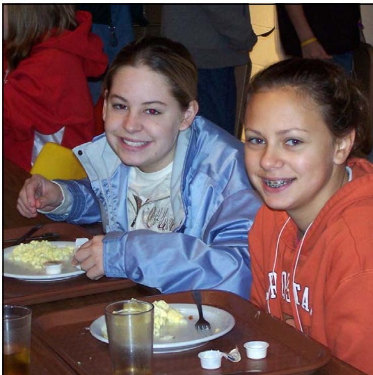
Girls pose for the camera during Saturday's breakfast.

Theme Verse: "Now we know that if the earthly tent we lie in is destroyed, we have a building from God, an eternal house in heaven, not built by human hands." 2 Corinthians 5:1