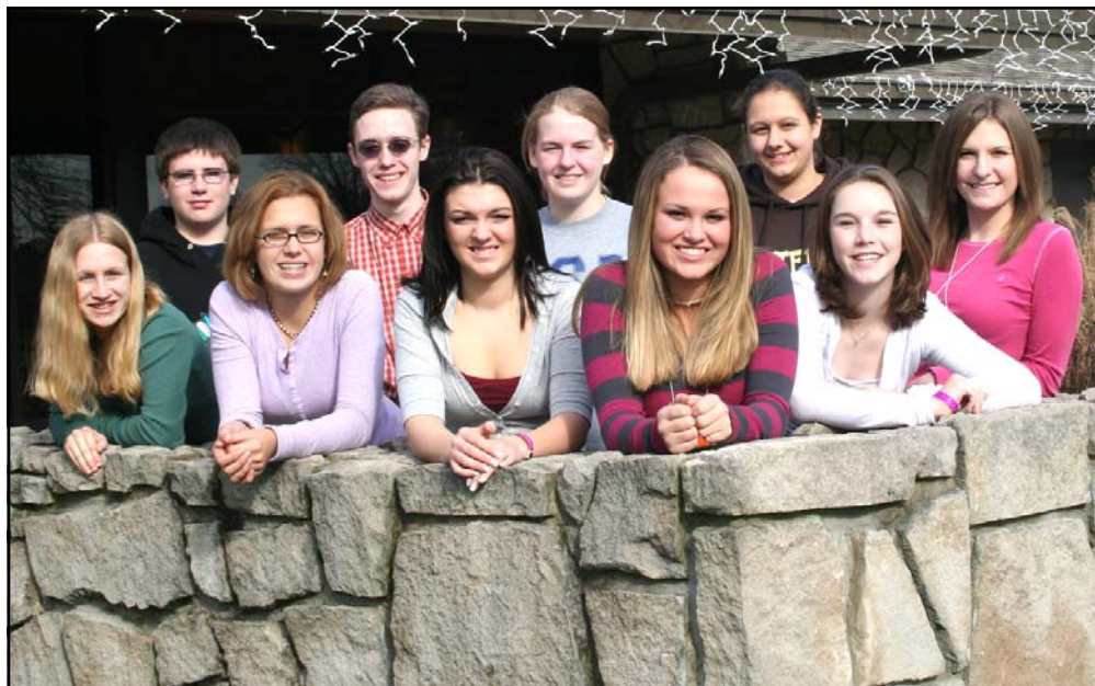
Fall Workshop 2006 Newspaper Staff takes a brake from work to pose for a picture during the afternoon work time.